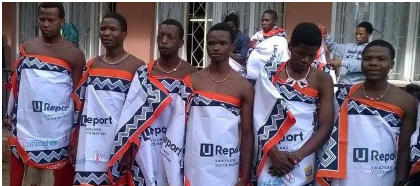
U-Report is formally launched in Swaziland after high-level Government approval.

to generate reliable and quality real-time data, with staff capacity-building for the use of that data for planning and monitoring health interventions. UNICEF Swaziland has also introduced an SMS-based citizen engagement platform, U-Report, to generate feedback from health facility clients and to promote public health messages. Engagement with the Government of Swaziland proved to be a critical first step in introducing U-Report, followed by explaining how the platform could be used as a health system strengthening platform in order to gain the trust and understanding of health workers.