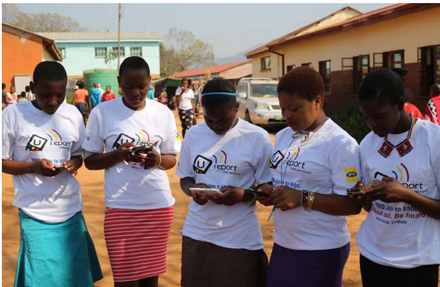
U-Report citizen engagement and social accountability SMS platform

From 2015, U-Report questionnaires have been issued on five key issues, such as facility staff distribution (captured by waiting time), health worker attitudes, and availability of medicines and supplies, etc. Health facility staff sensitize and mobilize all patients to enrol in U-Report and respond to the questionnaire by sending a trigger text to a short code. Results from the feedback are analysed and shared with all facility staff during monthly meetings. This prompts decision-making and