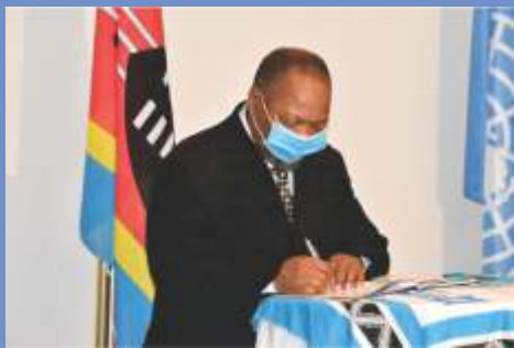
Minister of Economic Planning and Development, Dr. Tambo Gina.

The UNSDCF acts as a partnership and accountability framework between the United Nations Development System and the Government of Eswatini.