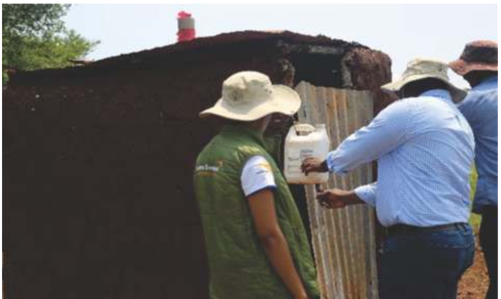
WASH team helping communities install handwashing points in homesteads.

Neonatal Intensive Care Unit (NICU) equipment was also procured by UNICEF for the Mbabane Government hospital. The NICU is scheduled to start operating in 2021.