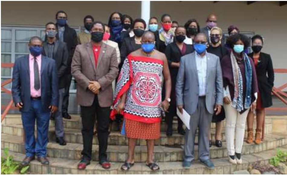
On 3 & 4 September 2020, the ILO Pretoria in collaboration with ILO International Training Centre conducted a capacity building workshop on unemployment protection for key national stakeholders - government, social security Agency, Employers and Workers' Organisations. The Minister of Labour and Social Security Honourable Makhosi Vilakati officially launched the commencement of the process towards establishing the Unemployment Benefit Scheme.

E swatini, although classified as a lower middle-income country, has high rates of poverty. About 59% of the population live below the poverty line, and about 20.1% live below the extreme poverty line.