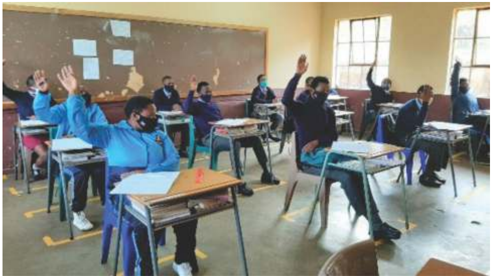
SAFE RETURN TO SCHOOL: Students participant during a return to school for higher grades.

The team further engaged Red Cross volunteers to conduct a door-to-door campaign aimed at engaging households on COVID-19 prevention measures through interpersonal communication and ascertaining challenges they encounter in their communities in relation to adhering to safety precautions. The campaign, through