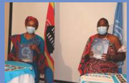
UN Resident Coordinator and Prime Minister show off the signed documents.