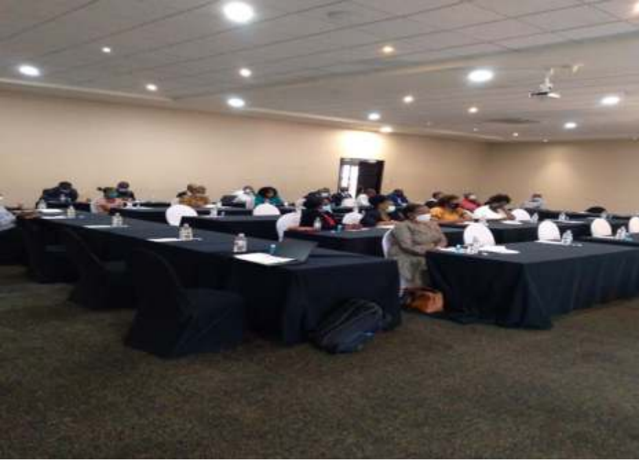
Stakeholders at a workshop for developing ASRH Toolkit

Toolkit to standardise messaging from school, family and church