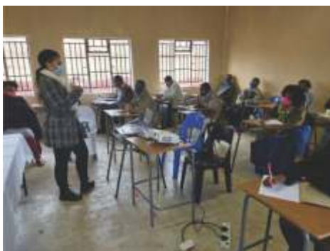
SNI facilitators learning about the commercial production of indigenous chickens.

Six literacy facilitators from three different Community Learning Centres (CLCs) have been trained to improve knowledge among community members on how to functionalise their basic literacy skills; a curriculum developed by SNI. Through these various learning programmes, community members have been enrolled in livelihood projects, including raising indigenous free-range chickens with the assistance of local breeders and suppliers of the chickens.