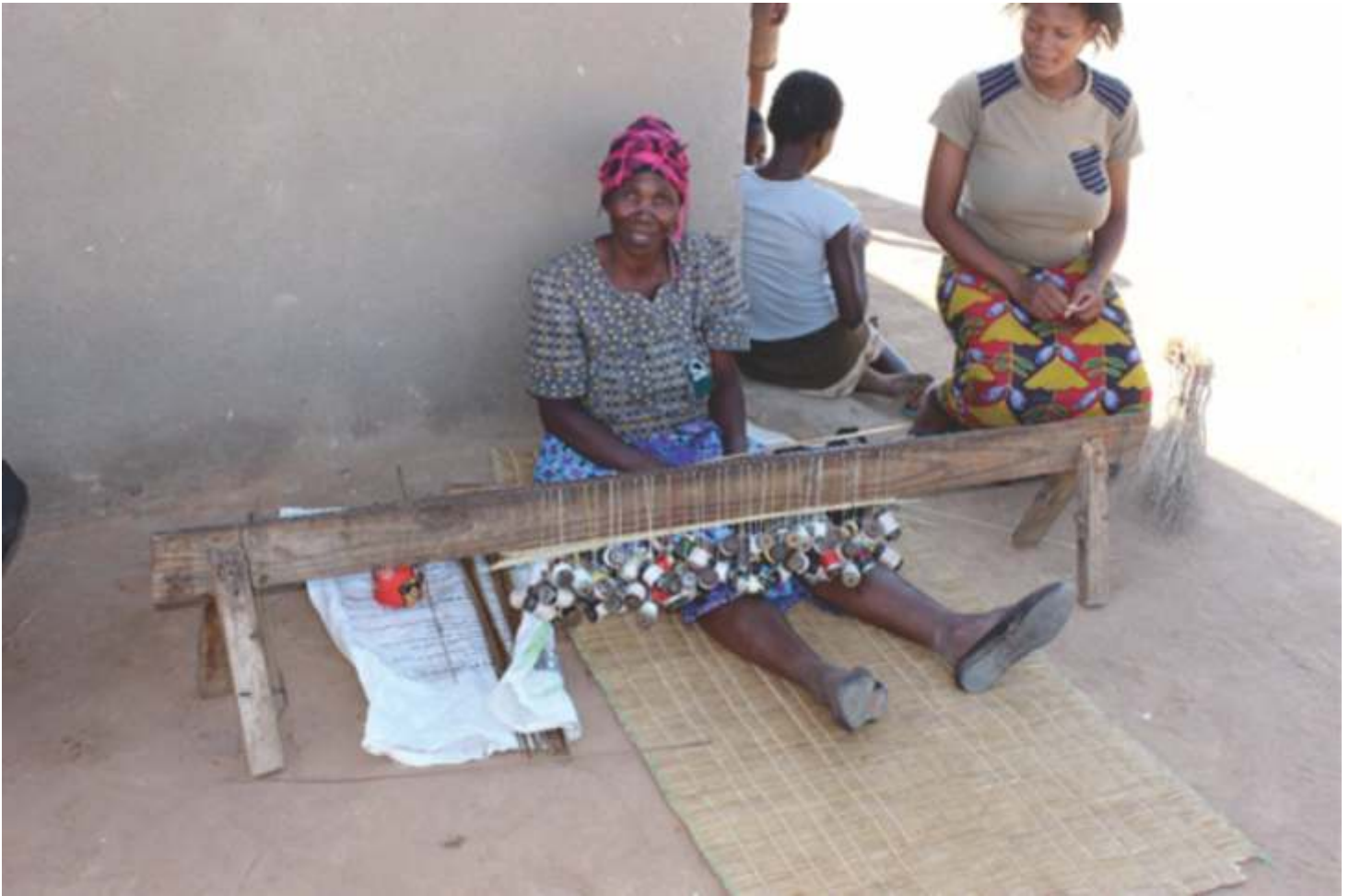
A livelihood activity, making grass mats.

we received our first entitlement in December 2019,” said Thulani. “I purchased fresh vegetables, oil, salt and clothes for the children.”