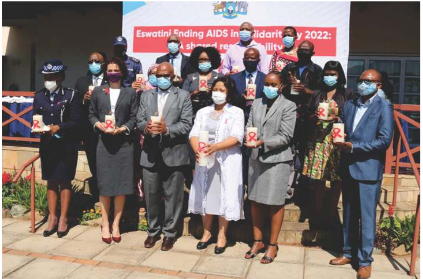
Minister of Health, Lizzie Nkosi flanked by stakeholders in the response to HIV & AIDS at the launch of the World AIDS Campaign