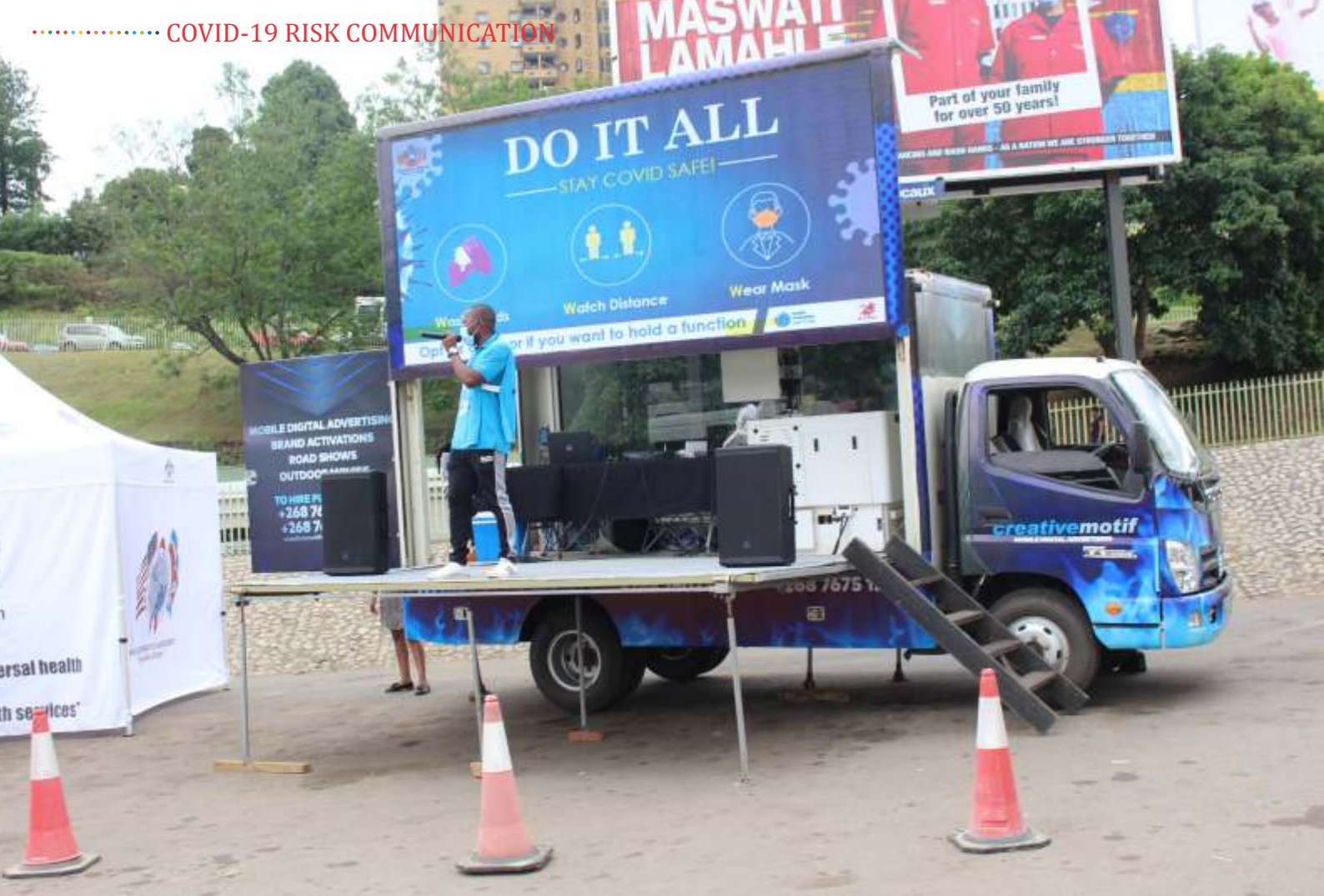
Mobile Digital Display truck was used during the roadshows across major towns and cities in the country