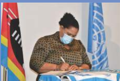
Minister of Education, Hon. Lady Howard-Mabuza.