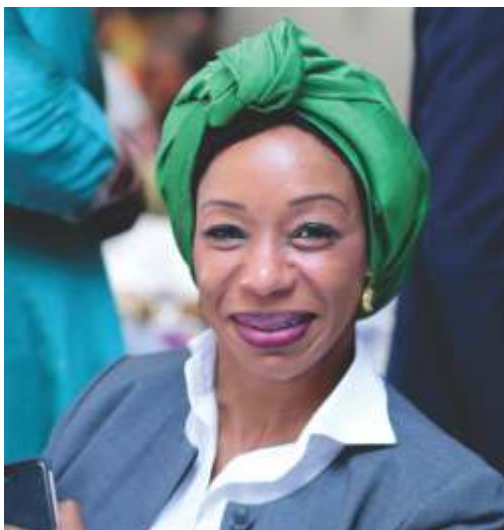
Ms. Nathalie Ndongo-Seh UN Resident Coordinator

The statistics are reflective of those collective efforts, as a total of 6,768 positive COVID-19 cases were reported, with a significant 6,379 recoveries, as of the 14th of December, 2020.