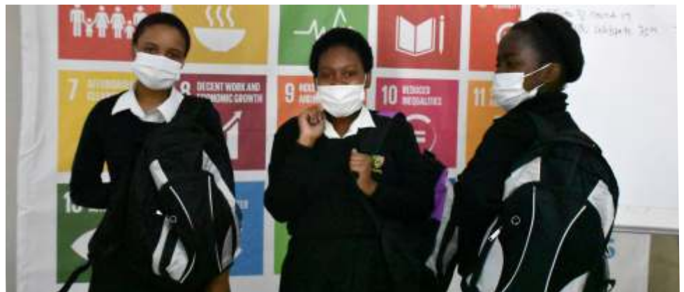
Children from Swazi National High School pose for a group photo after their dialogue.