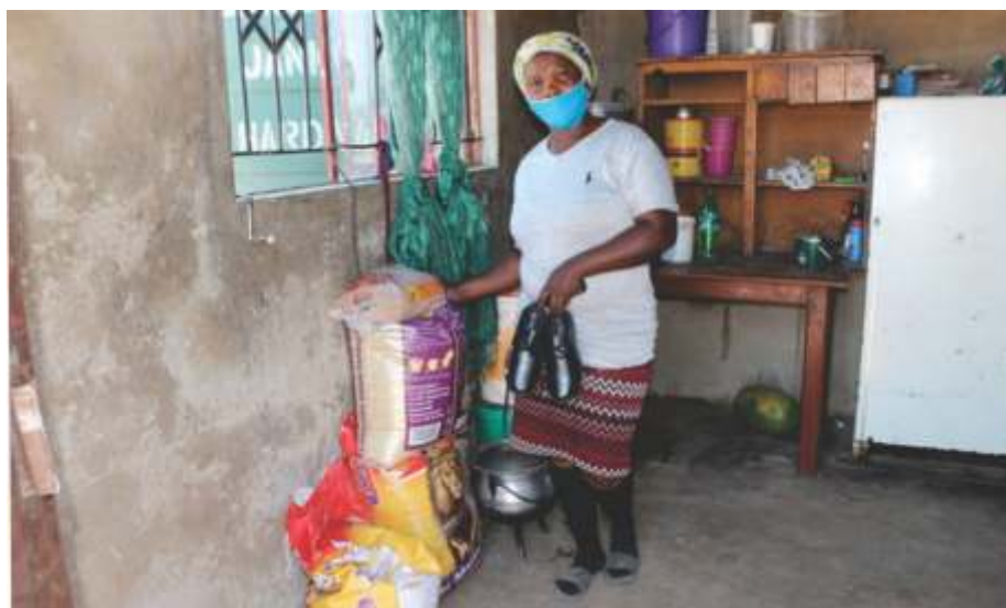
Cash transfers allow beneficiary to cover food and other necessities — in this case, school shoes for the children.

Funding from the Government of Germany, the European Civil Protection and Humanitarian Aid Operations and other donors means the World Food Programme