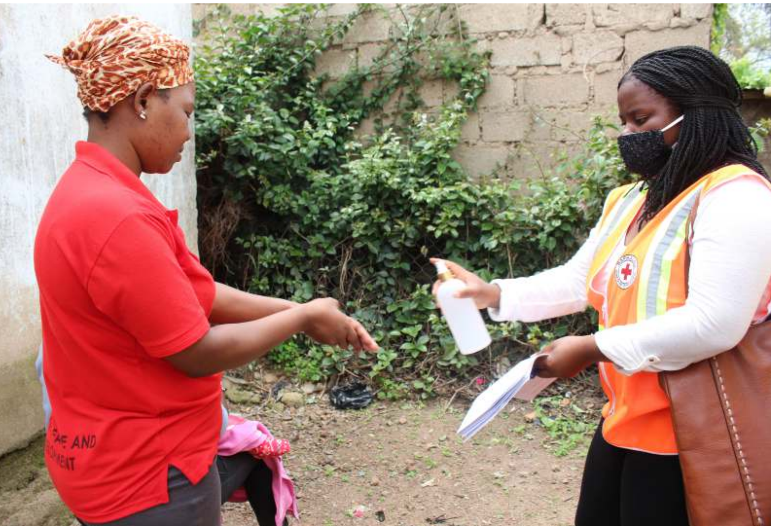
A volunteer from the Baphalali Red Cross Society helping a community member sanitize.