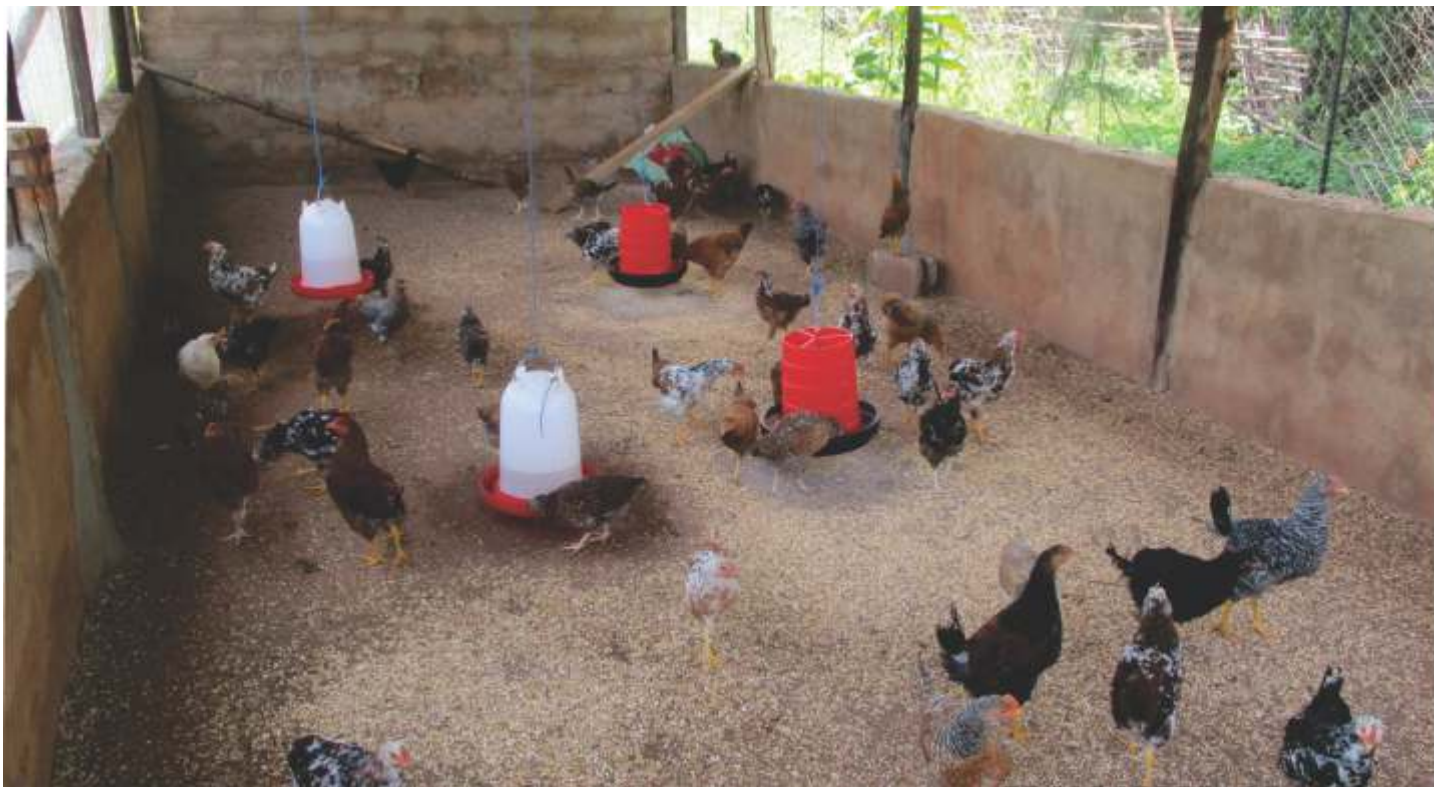
Indigenous chickens growing at the Mhlalini centre near Bhunya.