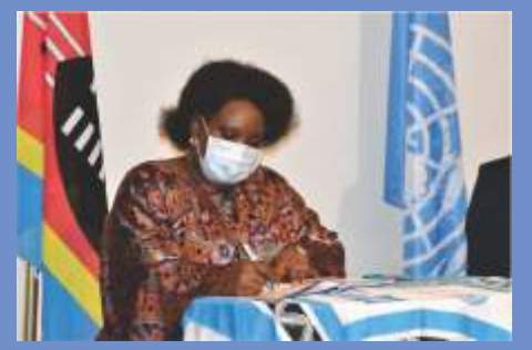
Minister of Foreign Affairs, Sen. Thulie Dladla.