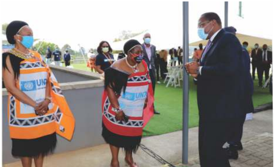
The Prime Minister, Minister of Foreign Affairs and the UN Resident Coordinator on a guided tour of information stalls at the carpark.