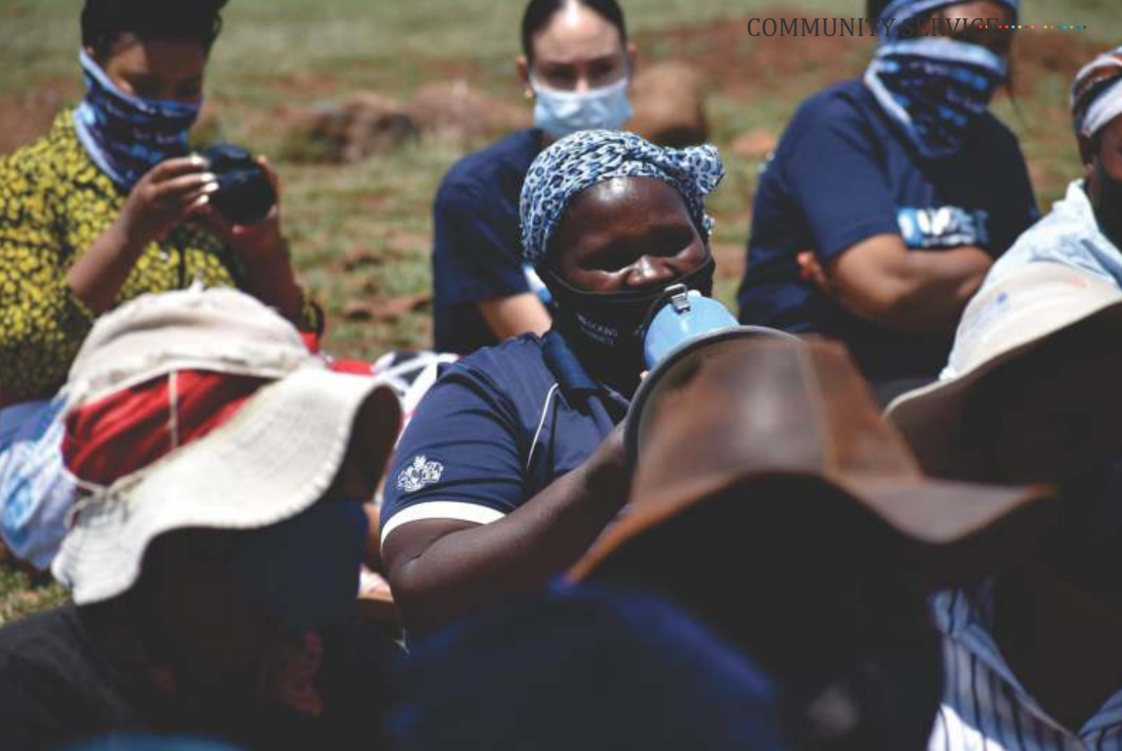
A member of the community makes a contribution during the meeting. The community lamented the lack of potable water, saying bathing was a luxury and only necessary when one needed to go to town only.