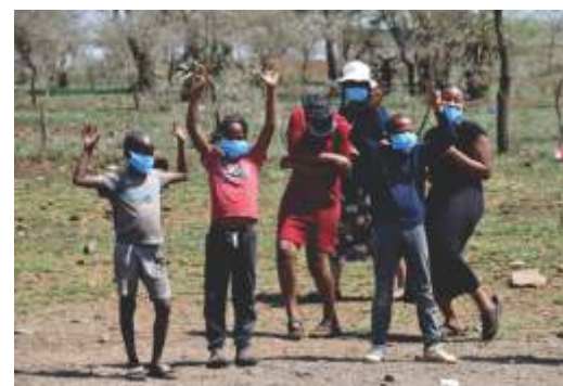
Lubulini youth displaying facemasks donated by the UN visiting team