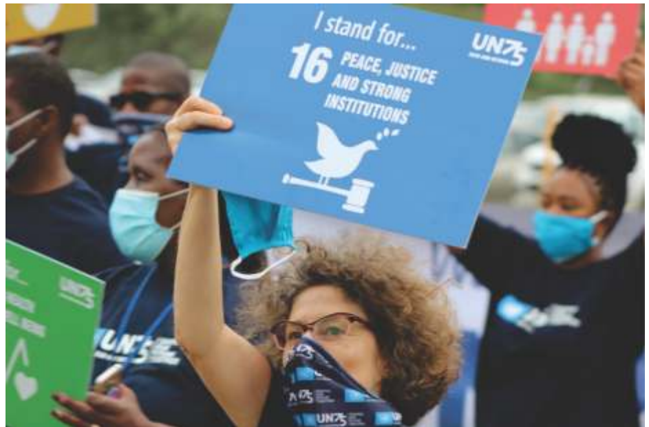
Un75 personnel and partners marching through Mbabane, promoting SDGs.

The UN Day celebration followed the signing of the United Nations Sustainable Development Cooperation Framework (UNSDCF) 2021-2025 on 22 October, by the Government of Eswatini and the United Nations Development System. The UNSDCF is a strategic instrument that acts as a partnership and accountability framework between the United Nations and Government of Eswatini.