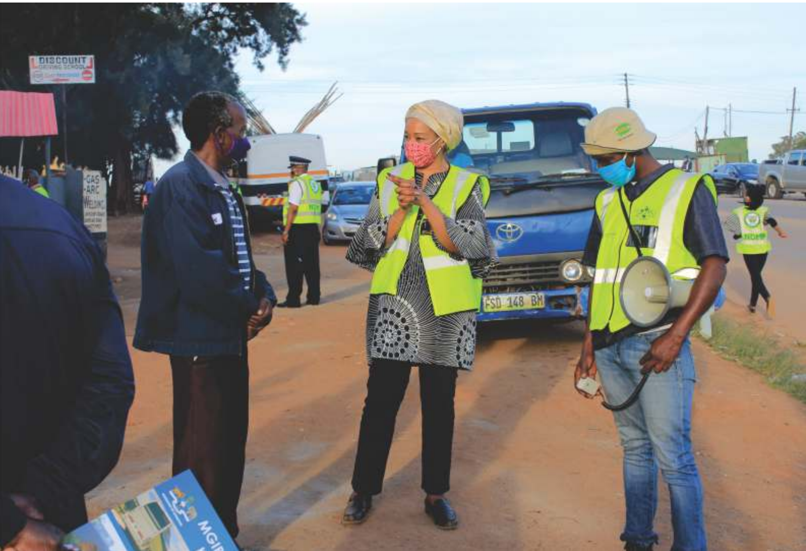
UN Resident Coordinator joined the Manzini volunteers during community outreach at Mbhuleni Township in Matsapha.

The ceremony was followed by a tete-a-tete between his Majesty and his entourage, and the UN Resident Coordinator accompanied by UNDP Resident Representative and WHO Country Representative to discuss issues of mutual concern.