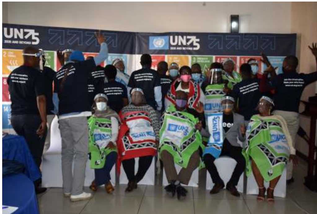
People Living with HIV (PLHIV) pose for a group photo at the end of their dialogue held in Manzini in July.

Despite limitations stemming from COVID-19, dialogues were held with most groups during the months of July to September 2020, with support from the