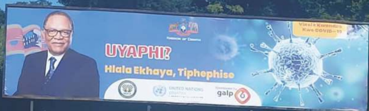
A billboard featuring the Deputy Prime Minister, Sen. Themba Masuku was among the 6 billboards supported by the UN to encourage adherence to lockdown measures as well as wearing of face masks in public places.