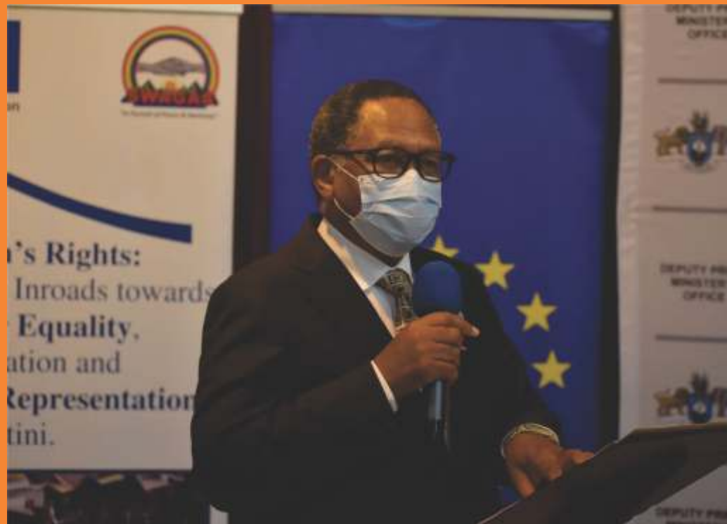
Deputy Prime Minister, Sen. Themba Masuku officially launched the campaign.