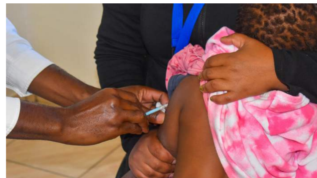
Child of UN personnel receives Measles and Rubella vaccine.