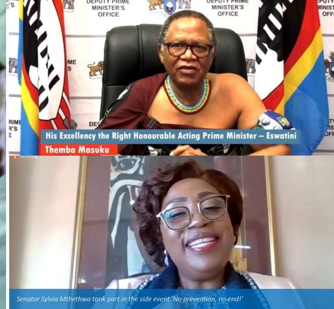
His Excellency the Right Honourable Acting Prime Minister – Eswatini Themba Masuku