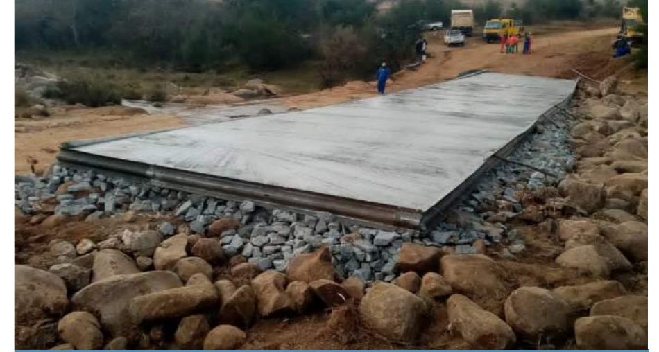
Mawelawela bridge being constructed as it was demolished by the Cyclone Eloise recently.

According to NDMA Programmes Director, the agency has provided material for the rehabilitation of roofing for 30 homes, as has it partnered with Baphalali Eswatini Red Cross Society to provide roofing material for 48 one-room houses.