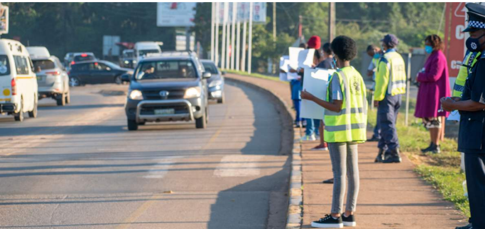
UN Staff Associations and the UN Department of Safety and Security (UNDSS), joined partners to commemorate the 6th UN Global Road Safety Week