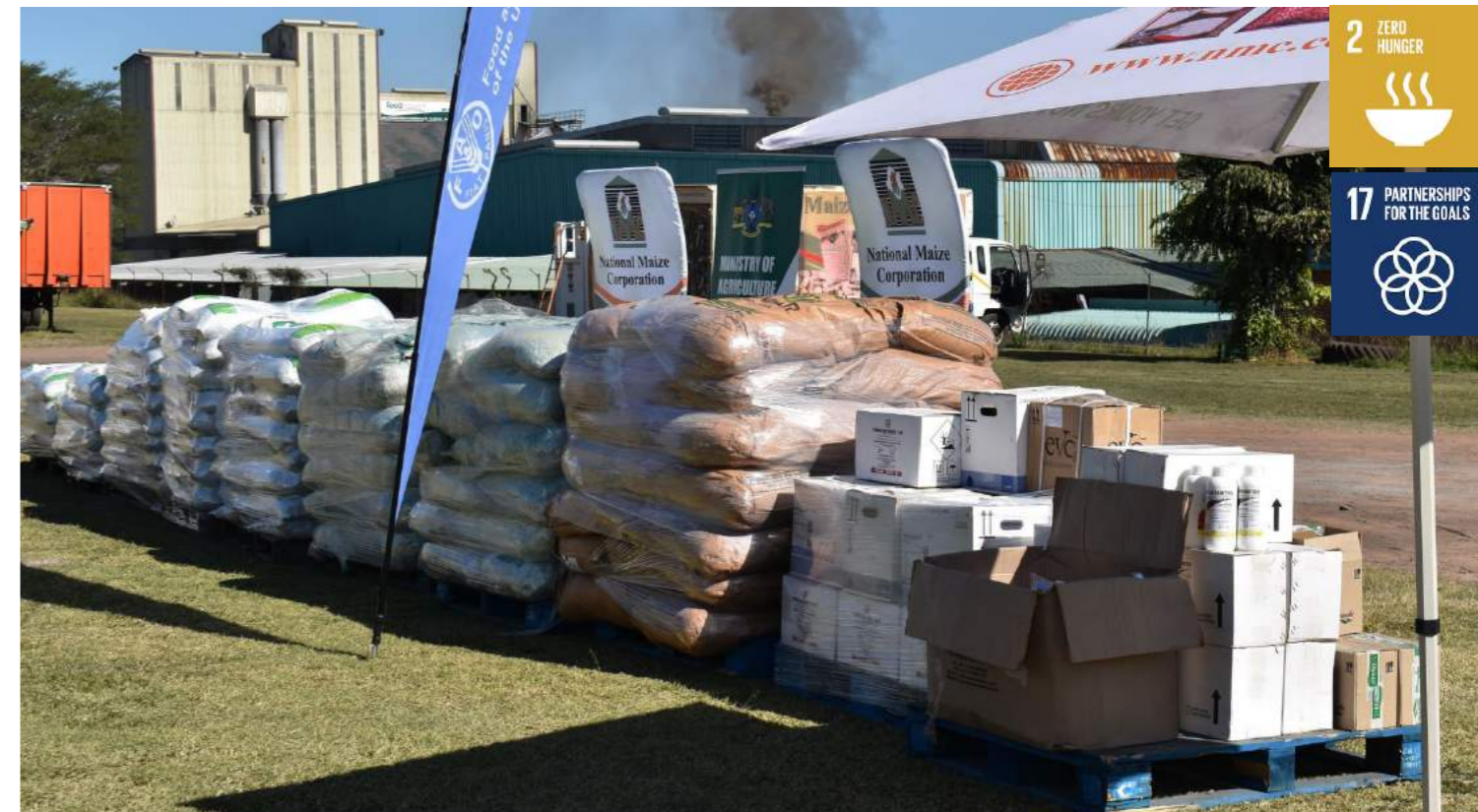
The United Nations Food Agricultural Organisation (FAO) donated farm inputs worth over E1 million (USD 60,000) to the Ministry of Agriculture and NMC.