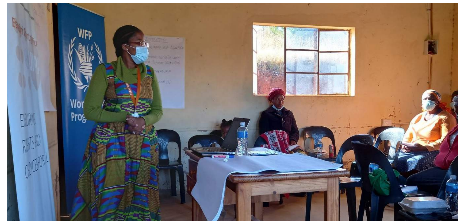
UNFPA gender specialist conducting a training session on gender issues.

WFP and FINCLUDE will identify existing and new clusters across the country, and develop an action plan to avoid duplications. The market-ready clusters will be linked to identified markets and supported holistically to ensure high performance in agronomic practices, financial management and value addition.