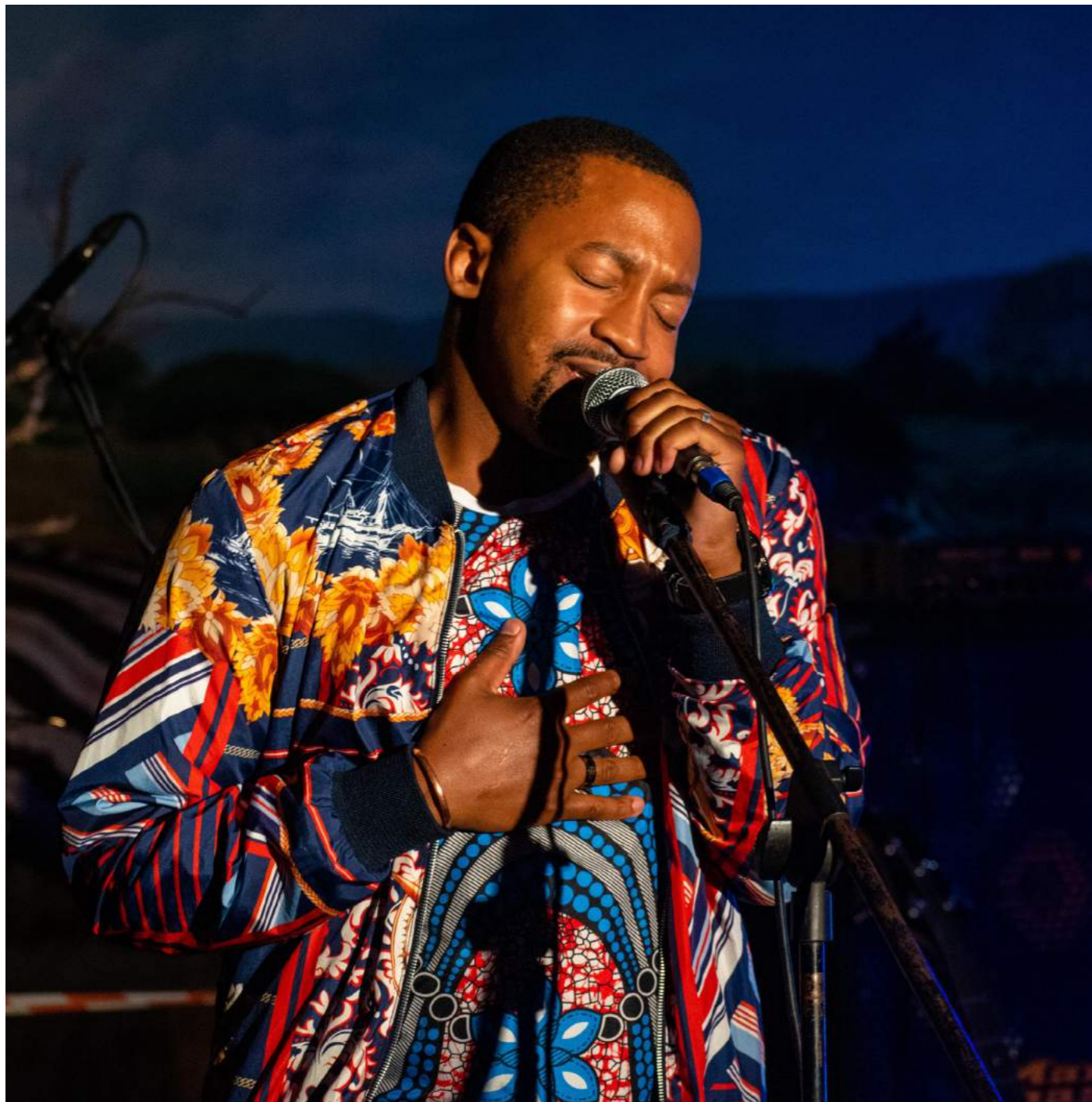
Eswatini top musician, Sandziso Matsebula, aka as "Sands" performing during the The 58th Africa Day Ceremony.