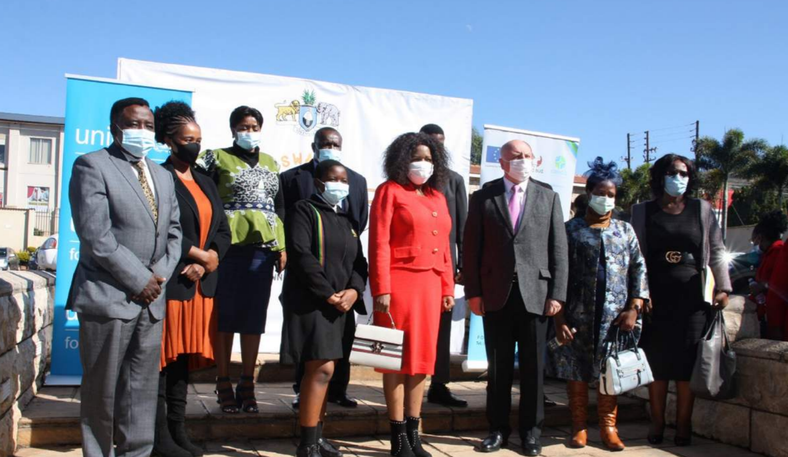
UNICEF Rep OIC Mr. Afshin Parsi and Minister of Home Affairs HRH Lindiwe Dlamini posing with other attendees during the launch of the children's month.