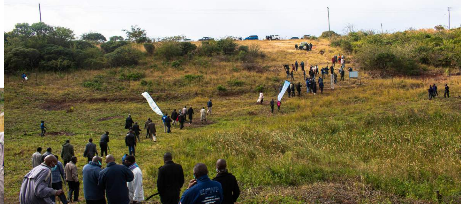
Local community, the government of Eswatini, Minister of Agriculture, Environmental Affairs, Eswatini Environmental Authority, and UN family leaving the wetland site.

The Minister of Agriculture expressed confidence that Eswatini can recover faster and restore its ecosystems by uniting as a country, planting trees where they are needed, and educating our children about the importance of protecting our ecosystem; "The world Environmental Day and Desertification and Drought Day are very critical to each one of us. It is not only important to the Ministry of Tourism, Environmental Affairs or the United Nations but to every one of us," he stated.