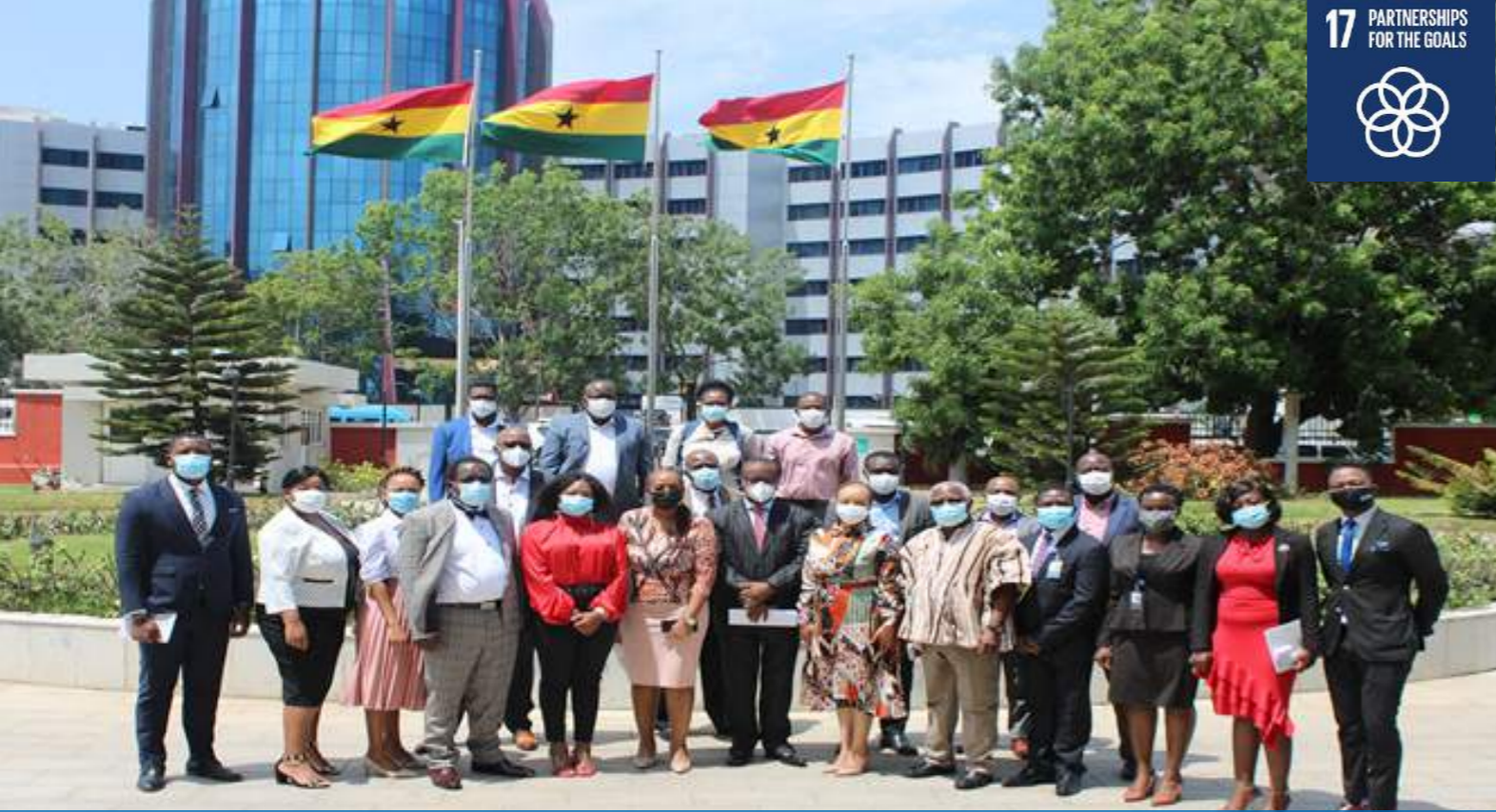
Eswatini Delegation at the Ministry of Foreign Affairs and regional Integration in Ghana