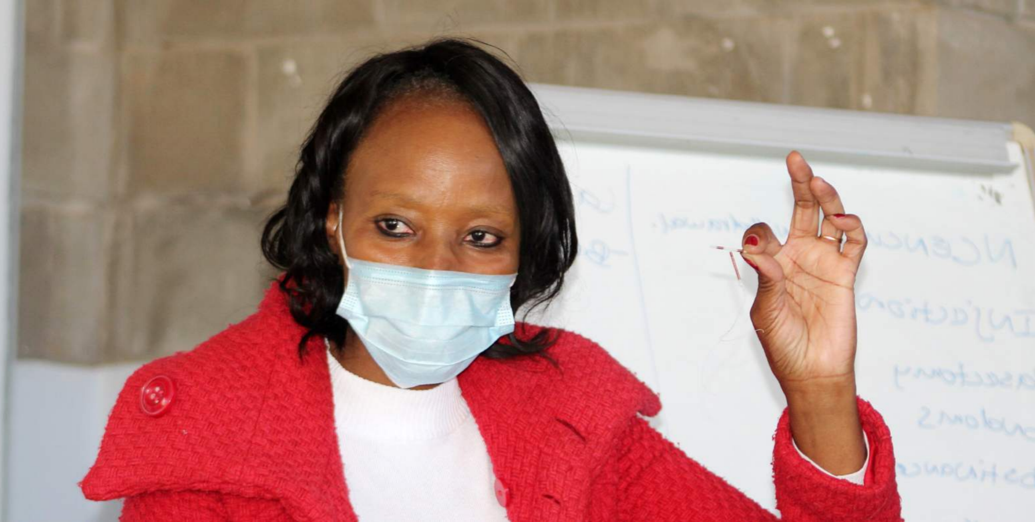
A nurse from FLAS demonstrating some of the available family planning commodities.