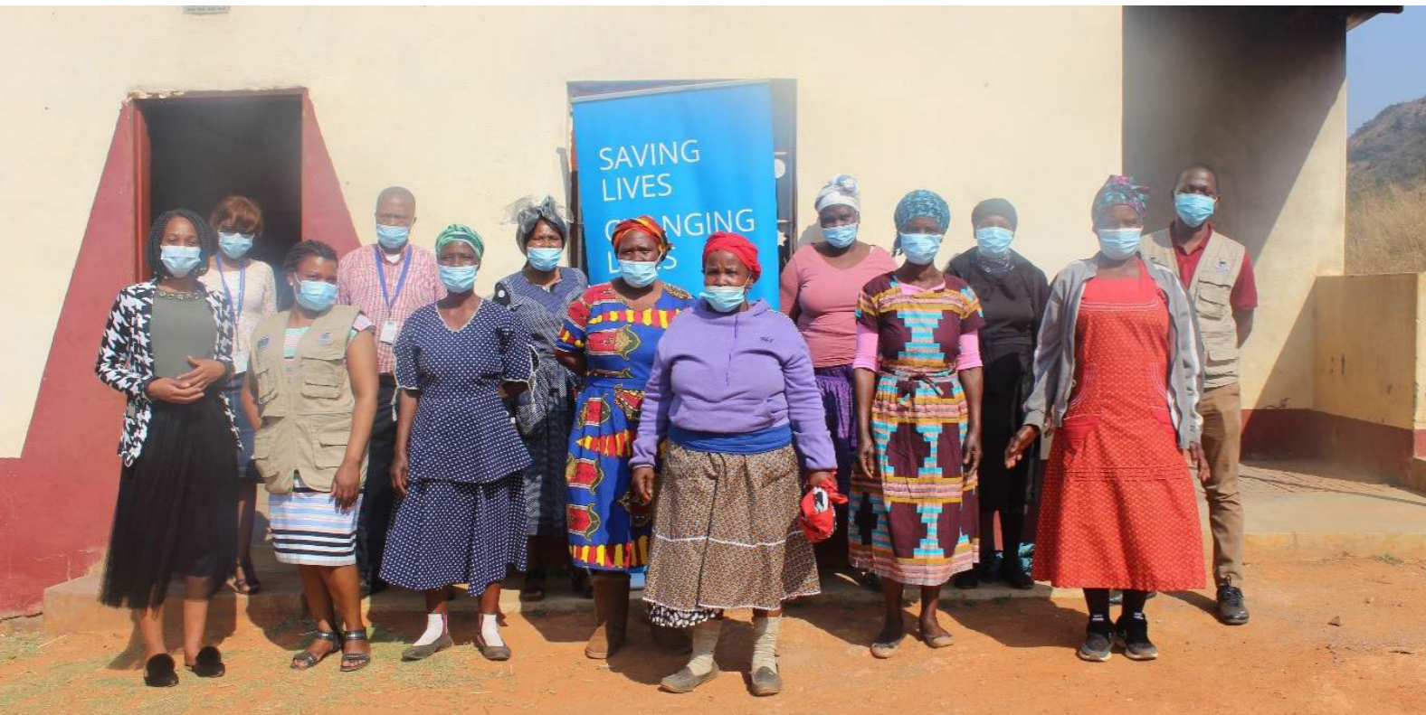
Intsaba yekubonelela Multipurpose Cooperative in Maphalaleni, Hhohho region pose for a picture after their training.

WFP Eswatini has partnered with the Centre for Financial Inclusion (CFI) with the aim to transform livelihoods of rural smallholder farmers, especially women.