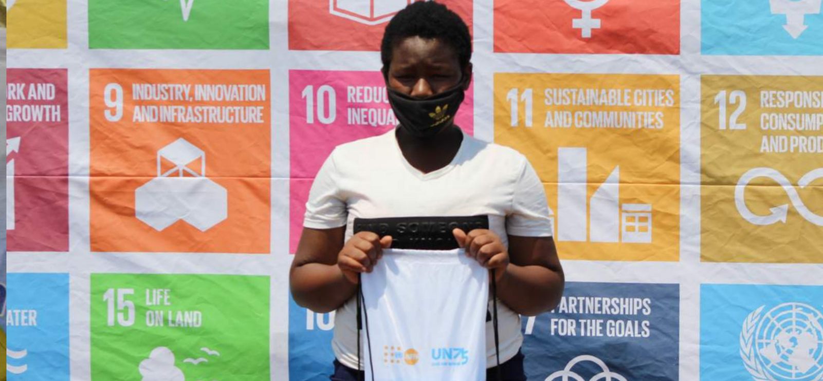
A young girl carrying a dignity pack donated by UNFPA at Ntuthwakazi during last year's UN Day Celebration.