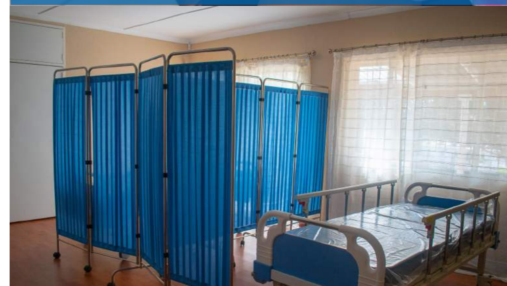
A ward in the UN Wellness / Isolation Care Centre.