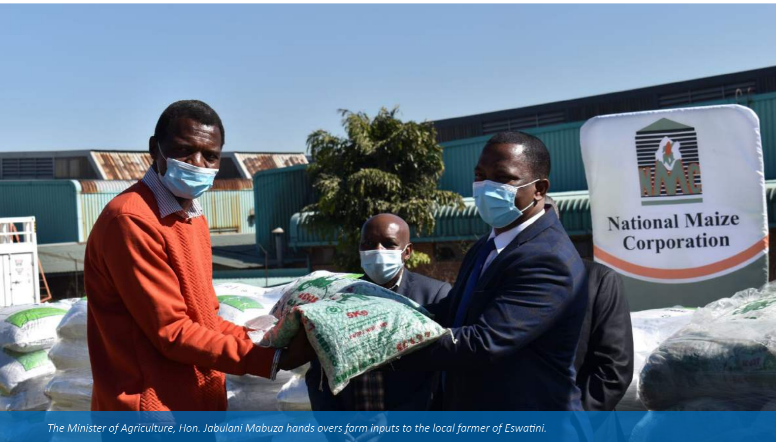
The Minister of Agriculture, Hon. Jabulani Mabuza hands over farm inputs to the local farmer of Eswatini.

On the 12th of May 2021, the United Nations Food Agricultural Organisation (FAO) donated farm inputs worth over E1 million (USD 60,000) to the Ministry of Agriculture and National Maize Corporation (NMC).