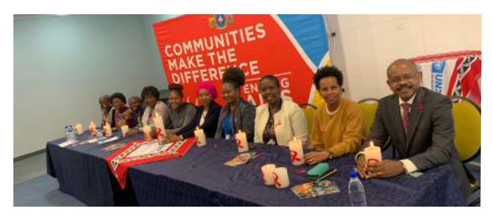
Members of the UNCT commemorate World AIDS Day with staff at the UN House on 6 December 2019.

The commemoration, which was organized under the auspices of the Ministry of Health and the National Emergency Response Against HIV and AIDS (NERCHA), included exhibition by stakeholders in the national response to HIV and AIDS.