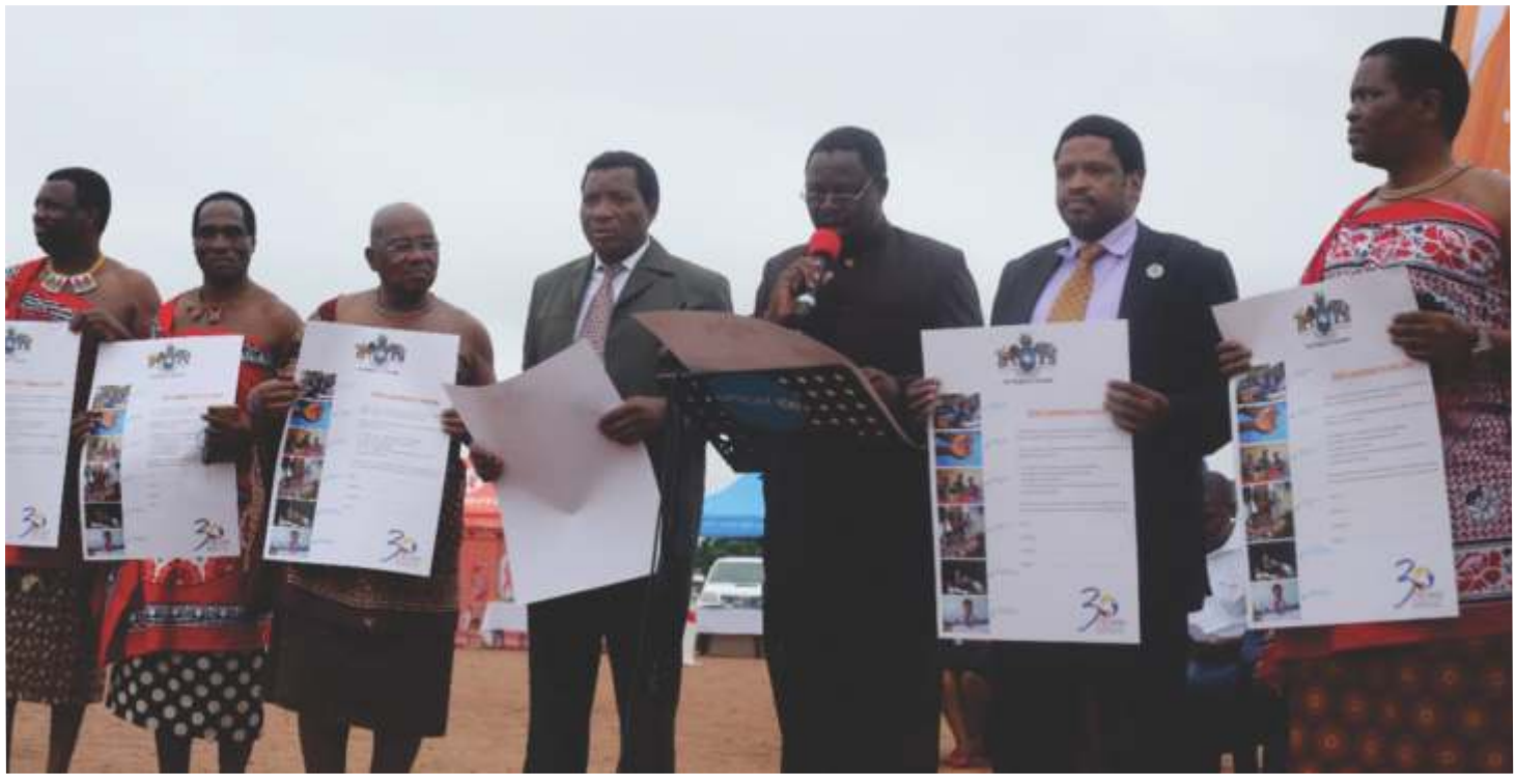
Chiefs from various chiefdoms in the four regions of the country were also in attendance and made a pledge to ensure child friendly chiefdoms at the CRC @30 celebrations

offences and Domestic Act of 2018 and enactment of the Free Primary Education Act of 2012. In between presentations groups of students showcased their talent by doing speeches, poems, dancing, panels discussions and news reporting all relating to the CRC and how it has brought welcomed changes to children lives all over the world. The main highlight of the media breakfast meeting was the reveal of the CRC@30 logo that was used in Eswatini.