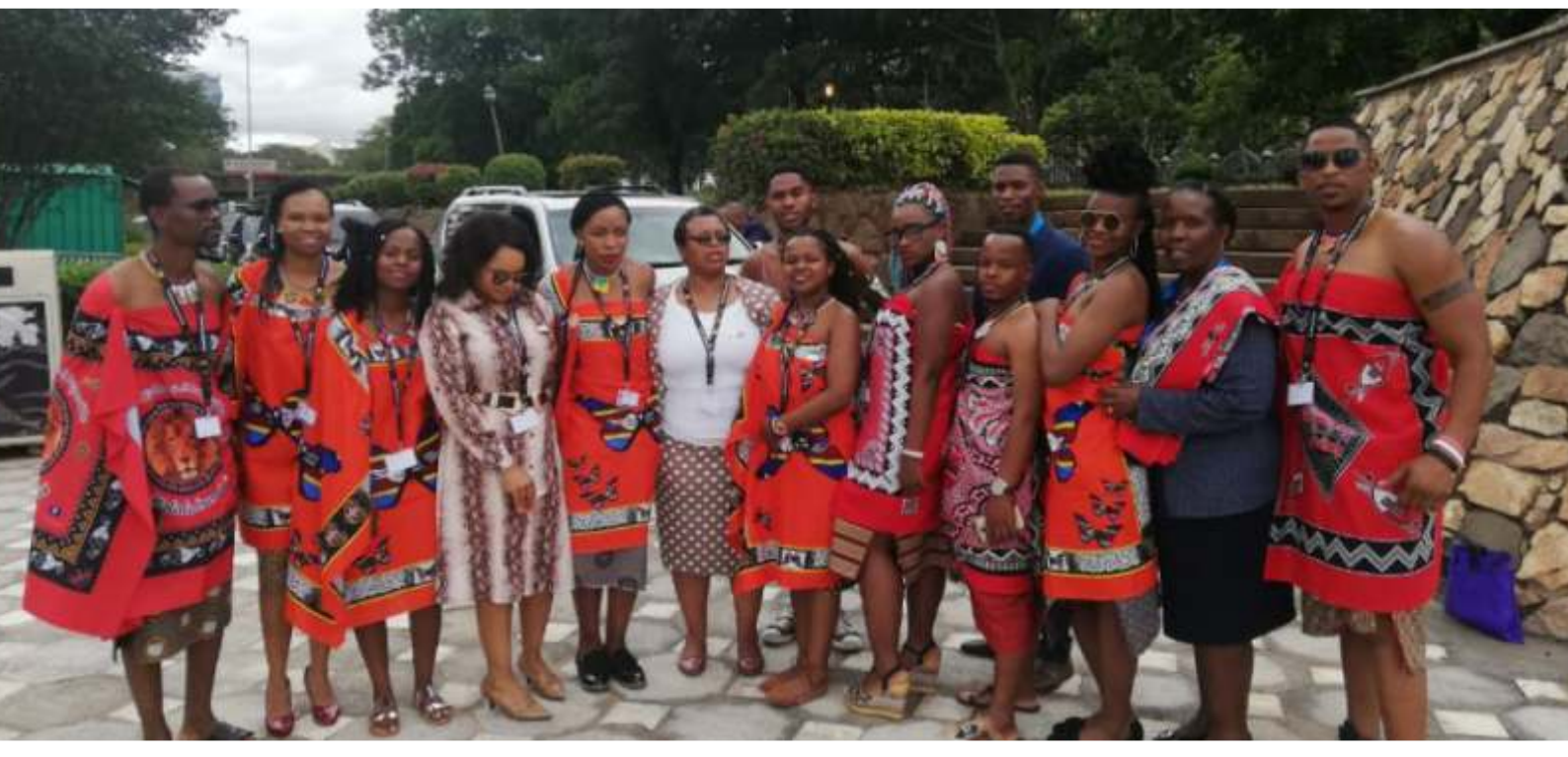
Eswatini delegation to the ICPD Global Summit in Nairobi, Kenya in November 2019