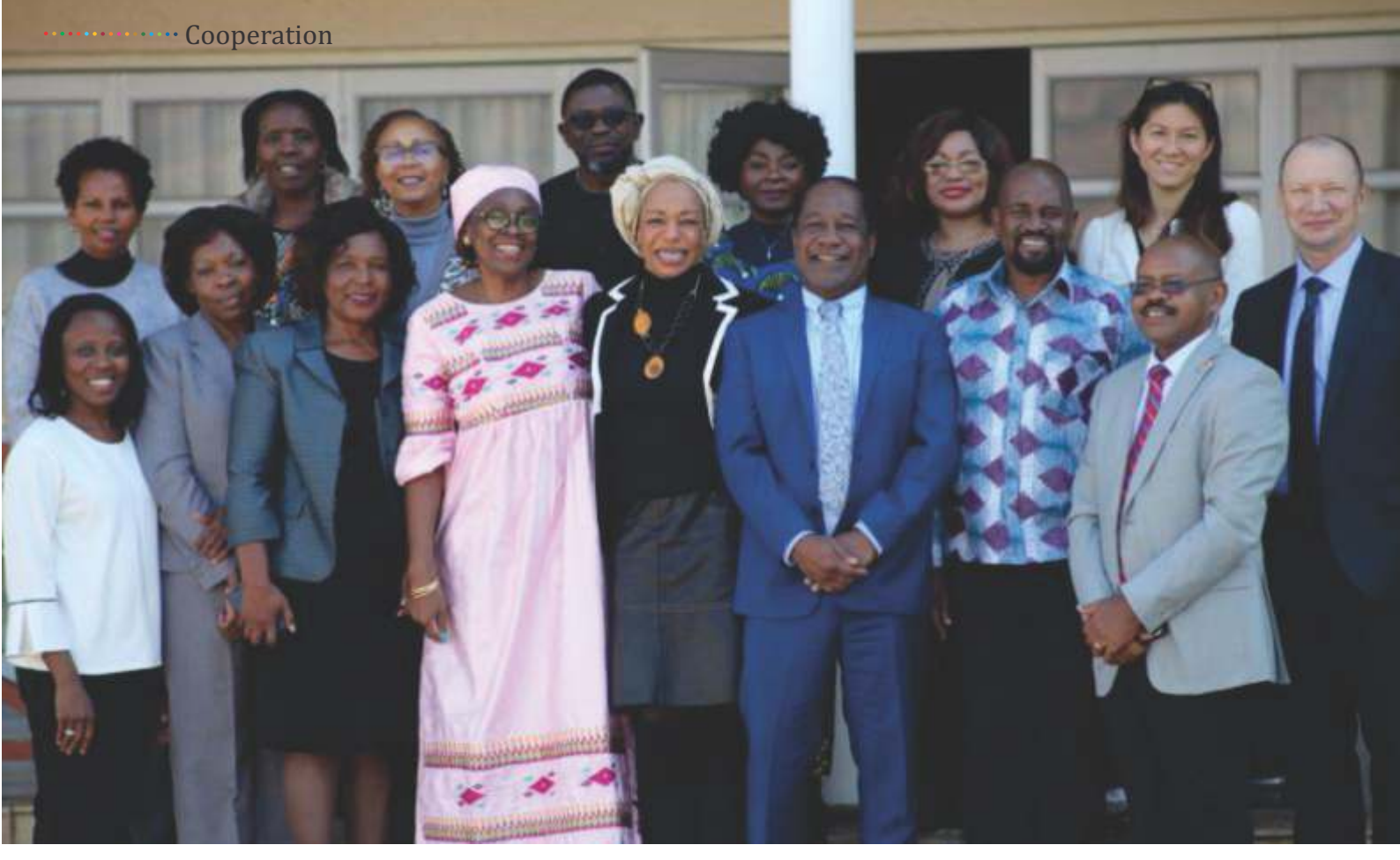
UNCT pose for a group photo during their retreat in June 2019