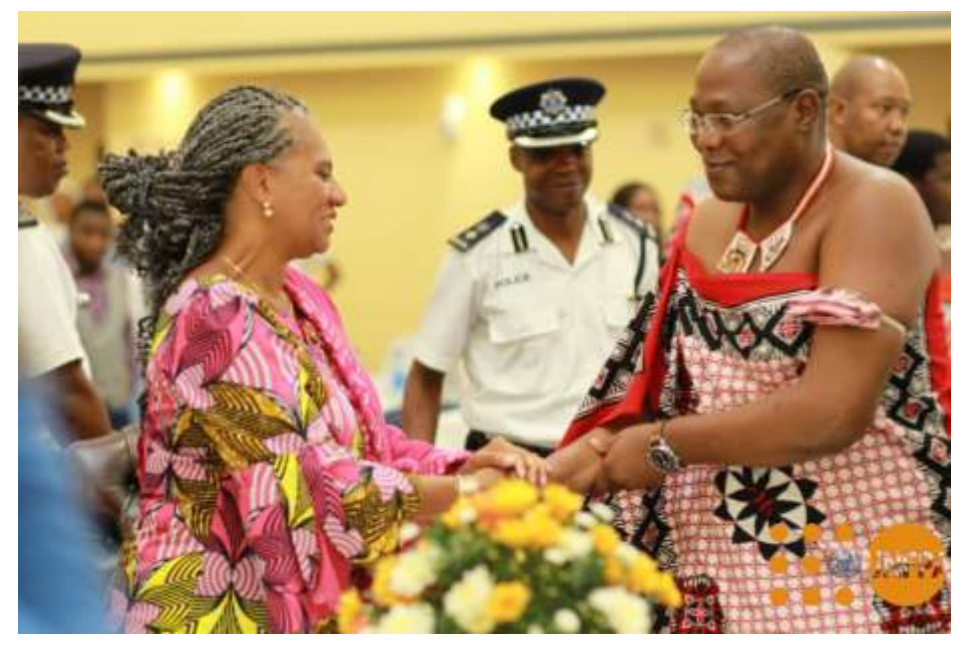
UNFPA Regional Director East and Southern Africa, Dr. Julitta Onabanjo meets with Prime Minister, His Excellency Mandvulo Dlamini during the double celebration launch in Manzni

She congratulated Eswatini for significant progress towards improving education, health, empowerment, safety and security and the standard of living of people, including women, children and young people. "Fertility levels have fallen due to voluntary family planning services which has significantly increased, with 3 out of every 5 women of reproductive age using a modern method of contraception," Dr. Onabanjo stated. "This is one of the higher rates in this region and one where government has been able to sustain reproductive health commodity security through a dedicated budget line for contraceptives."