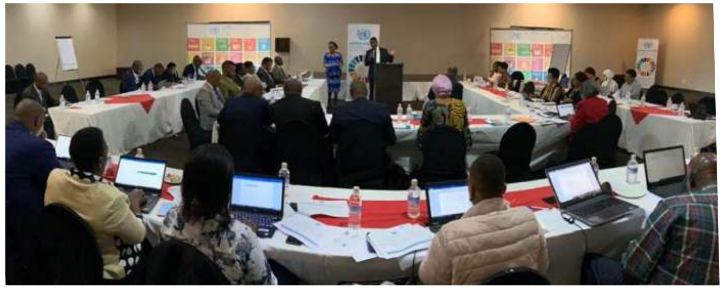
Members of the Joint National Steering Committee listening to presentations during their meeting in October 2019