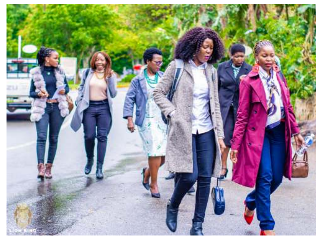
Participants arriving at the start of the Women Forum held at the Royal Swazi Sun in December 2019.

Over 300 women from all walks of life attend first of its kind forum