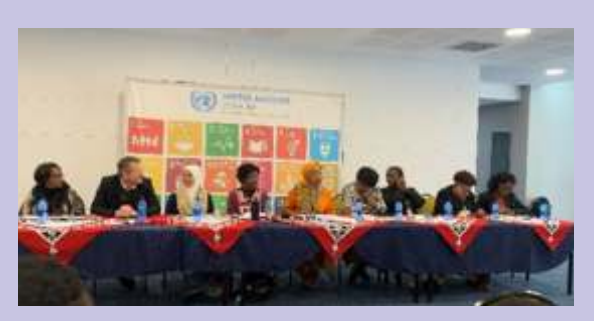
UNCT members addressing staff in the last Tow Hall in December 2019

The meetings covered the newly built UN House. As of the first Town Hall Meeting, the UN had very recently moved into the new premises, and as the year unfolded, staff was able to identify matters concerning the building that still needed to be