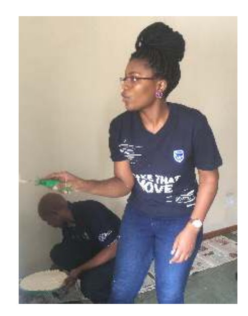
A Standard Bank employee painting one of the dormitories at the school

The Ministry is now in the process of establishing a special account for the Department to be used to collect revenues from the sale of finished products from the schools in a bid to make them self-sustainable.